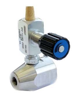
High pressure measuring chamber for applications up to 35.0 MPa