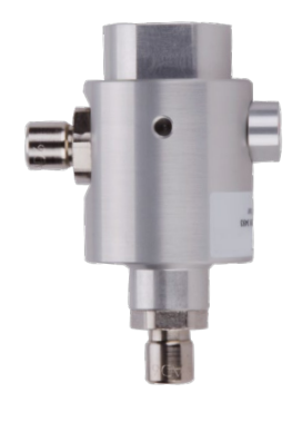
By-pass measuring chamber with 6 mm hose connections as in- and outlet