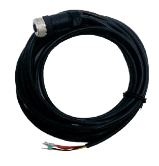
M12 Sensor cable with open ends 5 m or 10 m