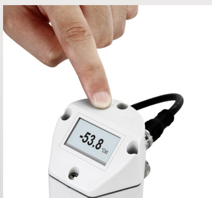
Alarm adjustment at dew point sensor