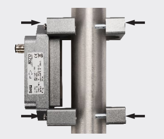
Easy clamp-on installation through mounting brackets