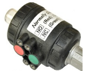
Optional NAMUR Solenoid Valve