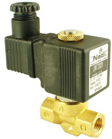
Brass body with Optional B7 coil