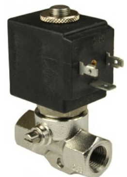
Stainless Steel body with Manual Override